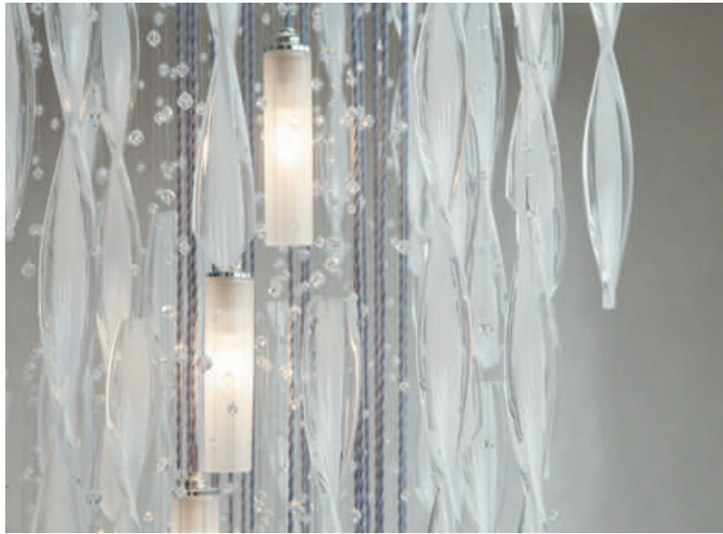
Paul Nulty's lighting designs for Eaton Place, Belgravia, London